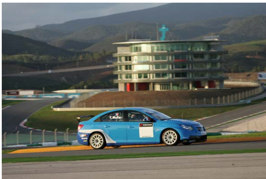
Yvan Muller's Chevrolet during the winter test at Portimão

Action at Portimão will begin on Friday afternoon at 14.30, when the drivers will explore the new circuit in a 30-minute test session.